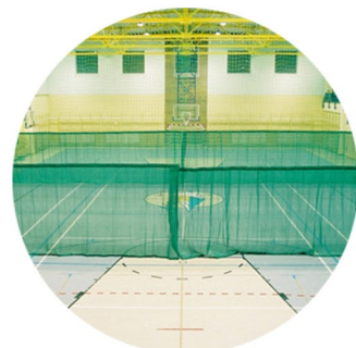
Curtain during folding/unfolding.