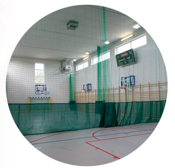
Curtain during folding/unfolding.