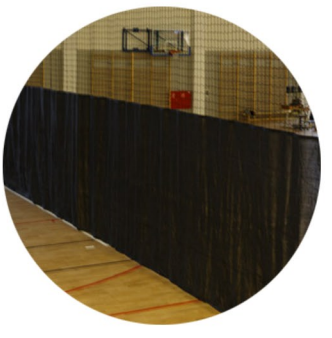
Bottom part of curtain made of visibility-limiting polyethylene fabric. Weight: about 200 g/m2. Colours: green, blue, dark green, black.